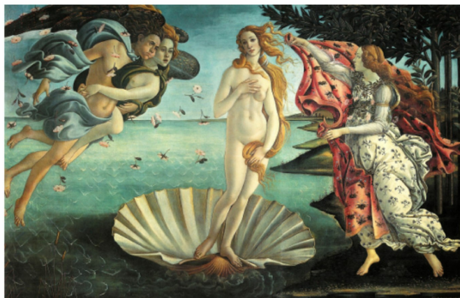
Botticelli's Venus. Koon's Cicciolina. Chen Yifei's Beauties.

Historically, the creation of art has been largely the preserve of men. And not a lot has changed. In recent years, the top 100 highest grossing living artists at auction were men, selling predominantly to male buyers. Women run just a quarter of the biggest art museums in the world, earning about a third less than their male counterparts. Yet while gender imbalance remains a fact, things have improved quite dramatically for women in the art world, especially when compared to the business world and its glass ceilings. From Middle Eastern sheikhas to American museum directors, from Korean gallerists to Japanese conceptual artists, the trajectory is up, not down, which is what really matters.