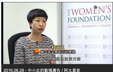
2016.08.28 - 中小企的數碼廣告 / 阿太當家